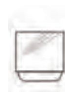
LEG-4 BOUILLON - 9 oz. 3 DZ.