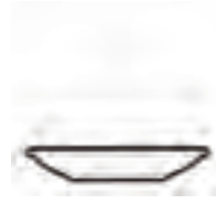
LEG-2 SAUCER - 5½" 3 DZ..