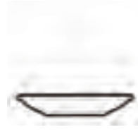
LEG-2 SAUCER - 5½" 3 DZ..