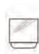
LEG-4 BOUILLON - 9 oz. 3 DZ.