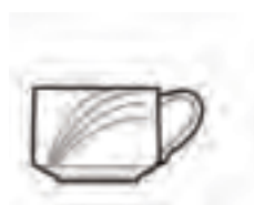
LEG-23 CUP, STACKING - 7 oz. 3 DZ.