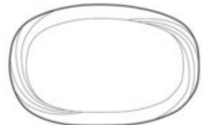
LEG-19 RECTANGLE PLATTER - 11¾" 1 DZ.