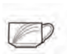
LEG-23 CUP, STACKING - 7 oz. 3 DZ.