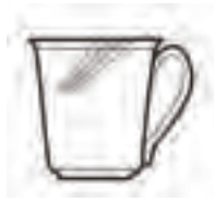
LEG-1 CUP, TALL - 7 oz. 3 DZ.