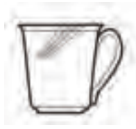
LEG-1 CUP, TALL - 7 oz. 3 DZ.